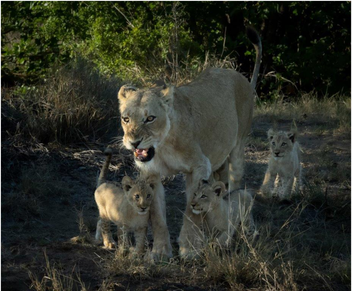
Anne Hrabar - Protective mom-