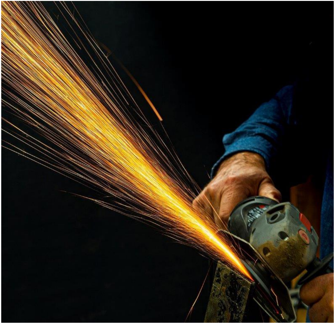
Veronica de Voogt - Hands at work