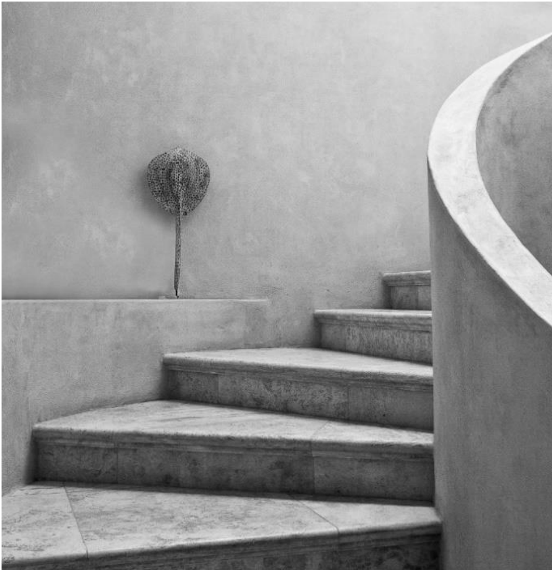
Round the bend