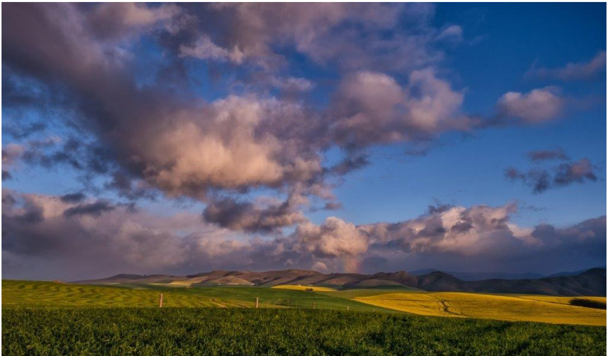
Eileen Covarr - Overberg magic