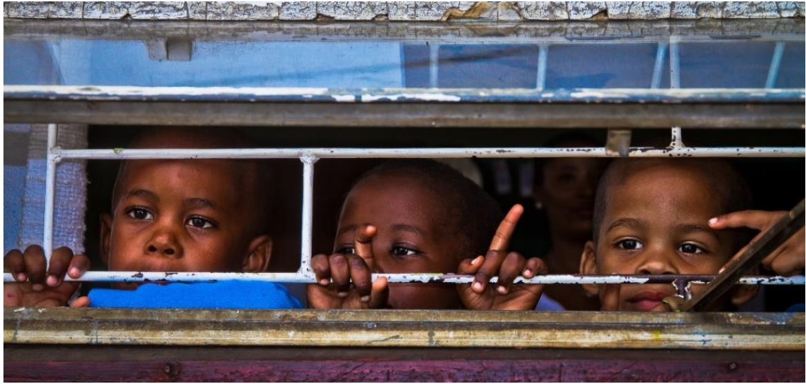
Selected for printing by PSSA for Exhibition in China