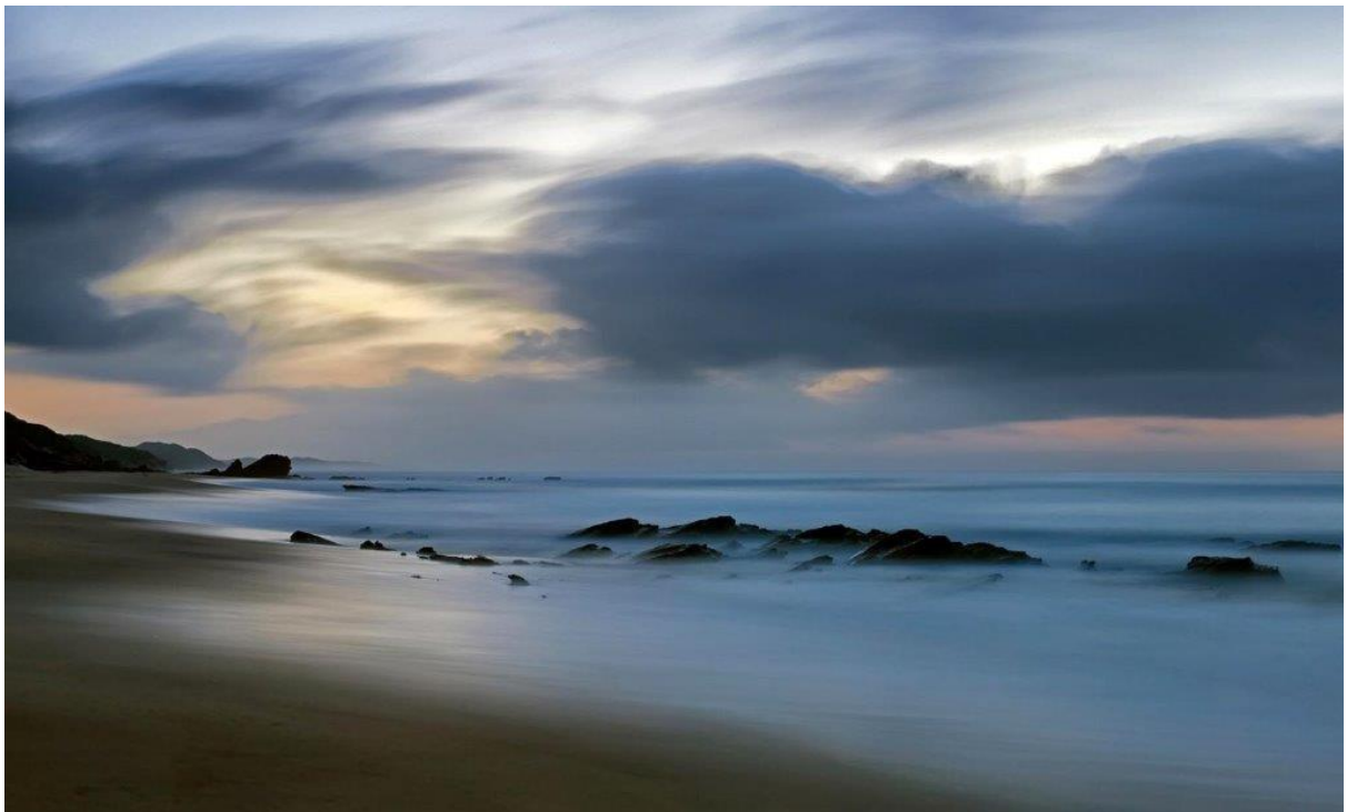
Des Kleineibst - Platbank Sunrise