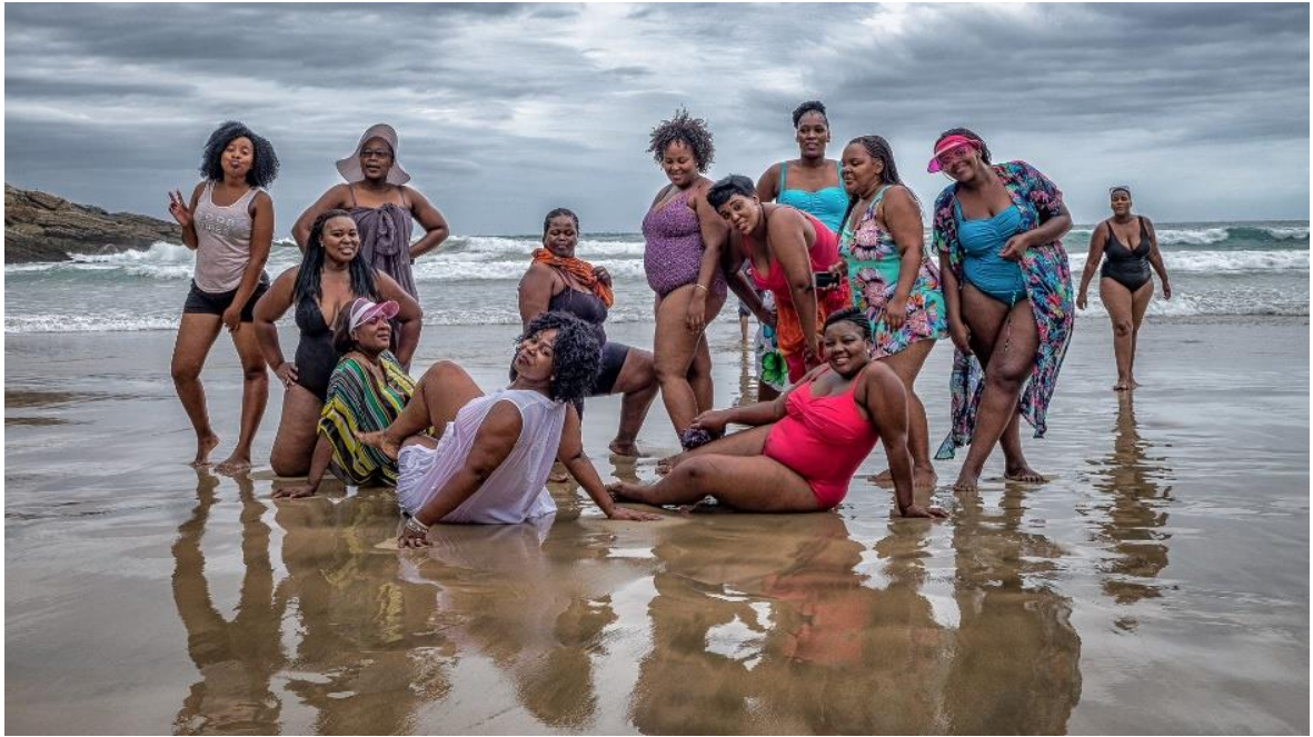
On the beach