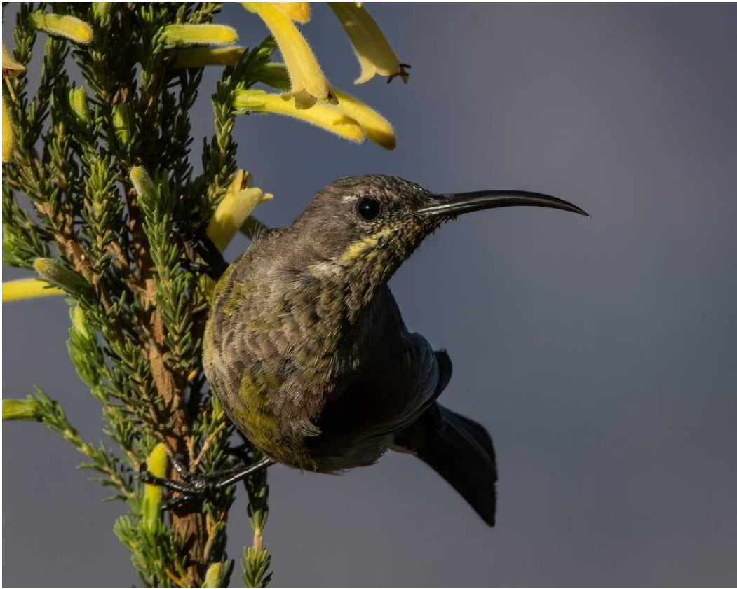
Willie Dalgleish - Orange Breasted Sunbird Female