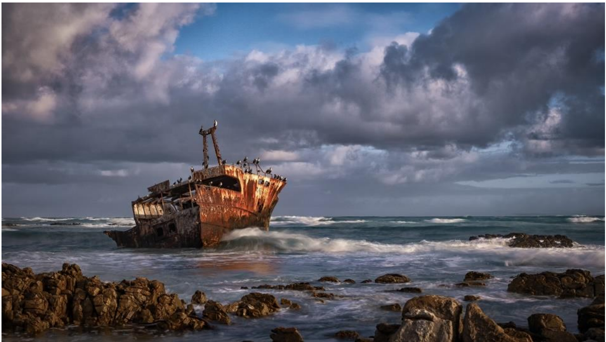
Light on the wreck