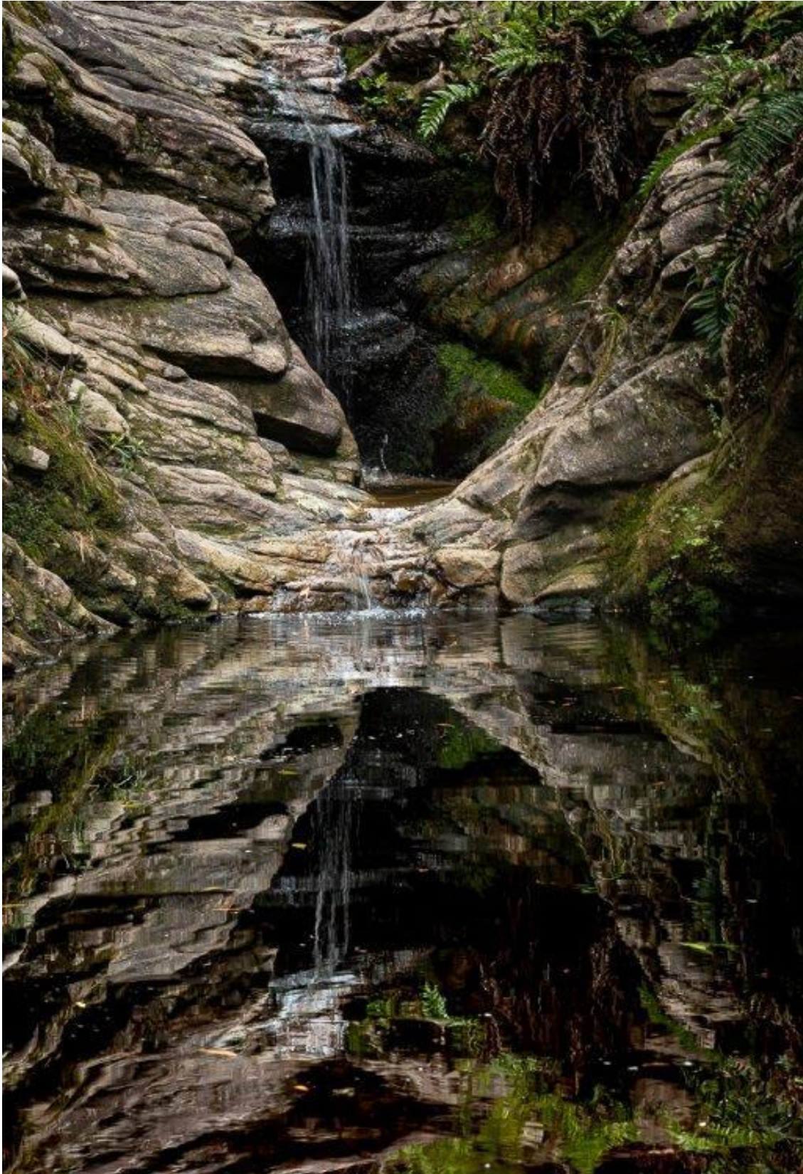
Kim Gaskell - Hour Glass