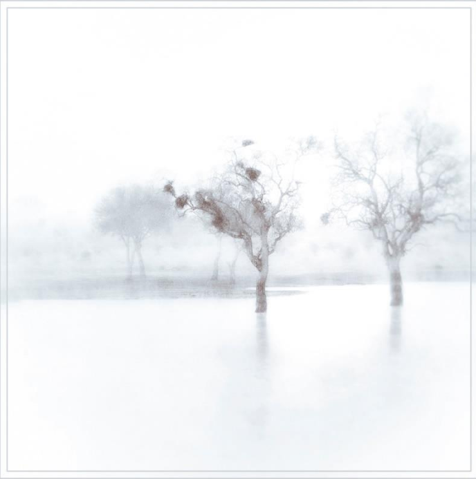
Still morning – Pam Brighton