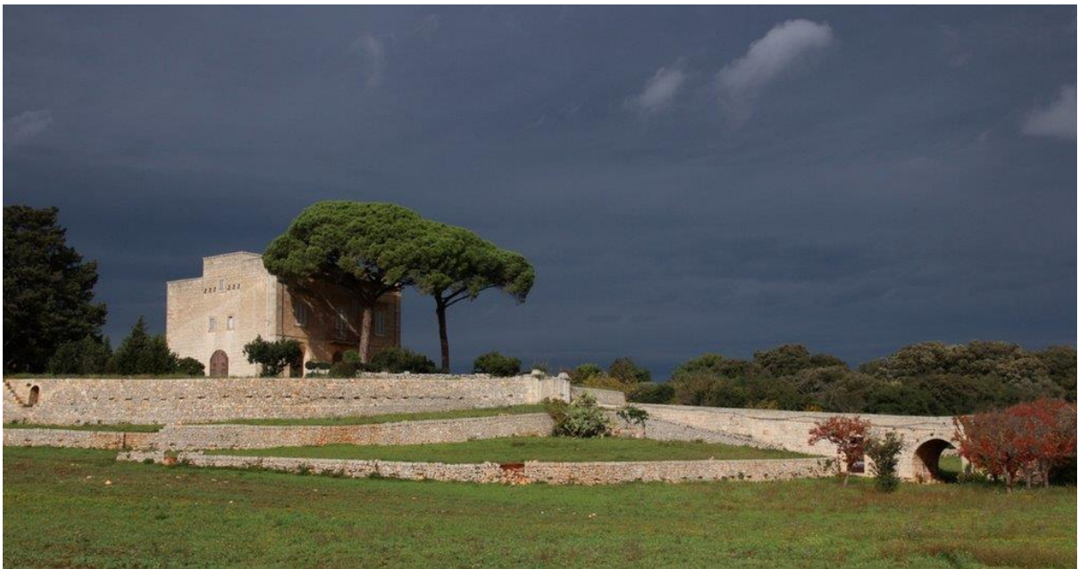
Maureen van den Heever - Before the storm -