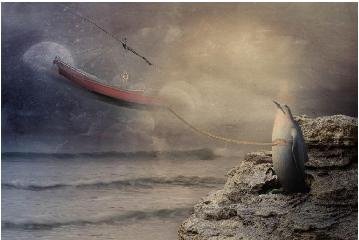
Sonia Elliott - Penguin Patrol