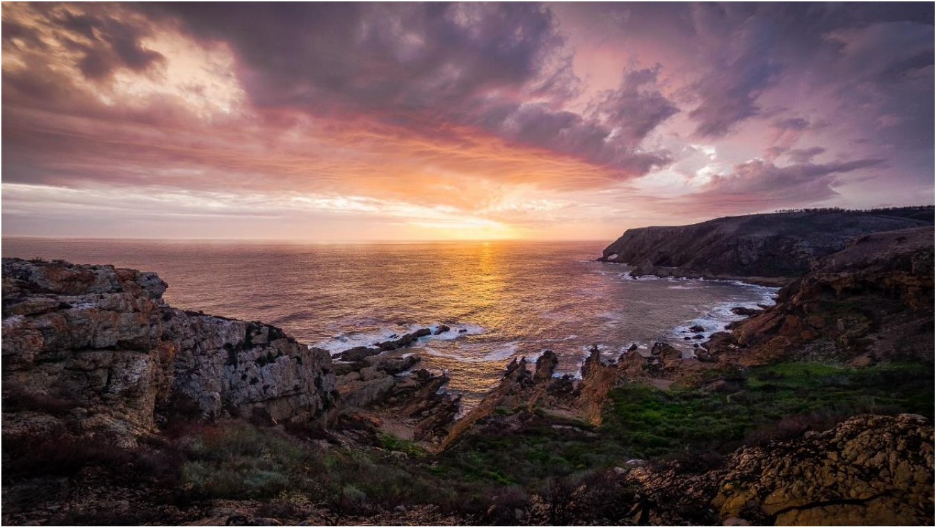
Stillbay at sunset