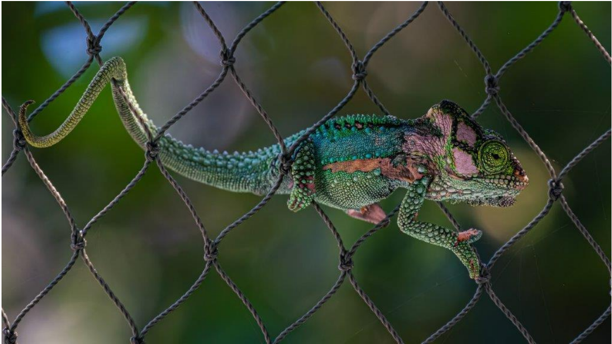
Cathy Birkett - Chameleon net Traverse