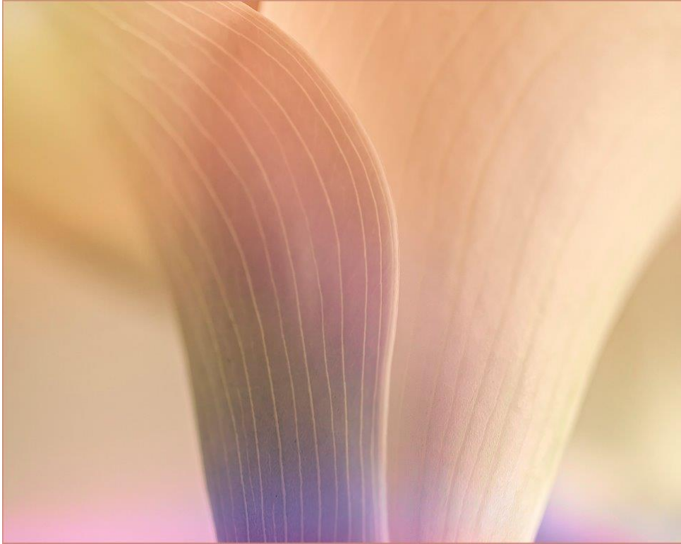
Calla abstraction - Pam Brighton