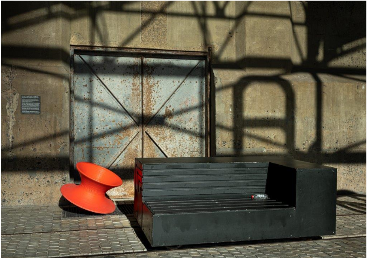
Red tops – Anne Hrabar