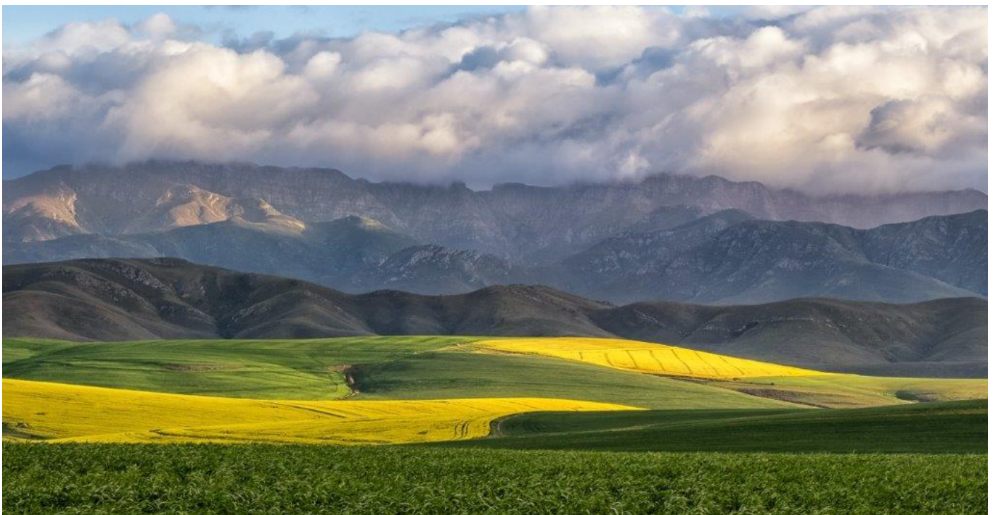
Light on the mountain – Eileen Covarr