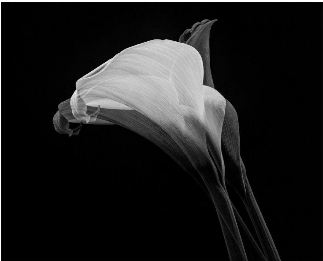
Three - Pam Brighton