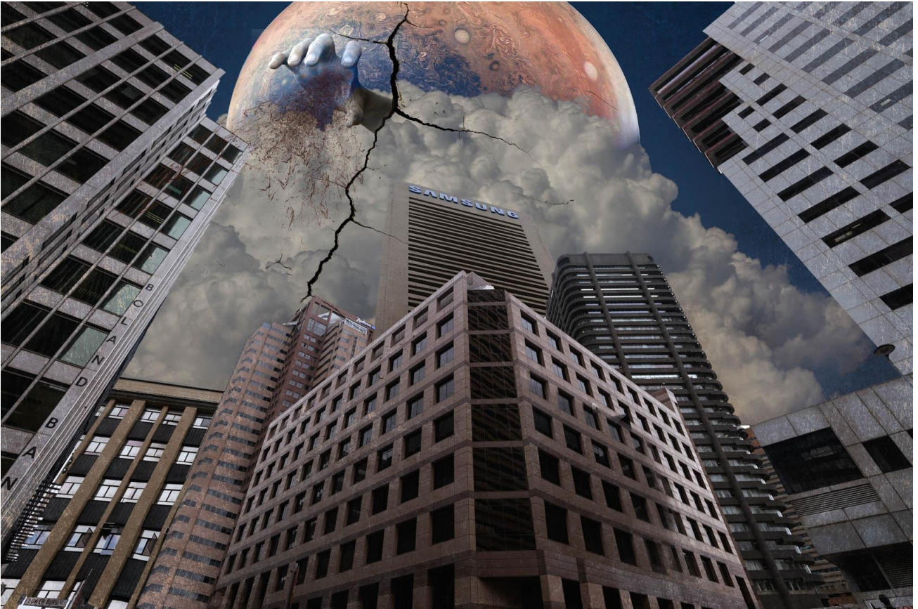
And so it came