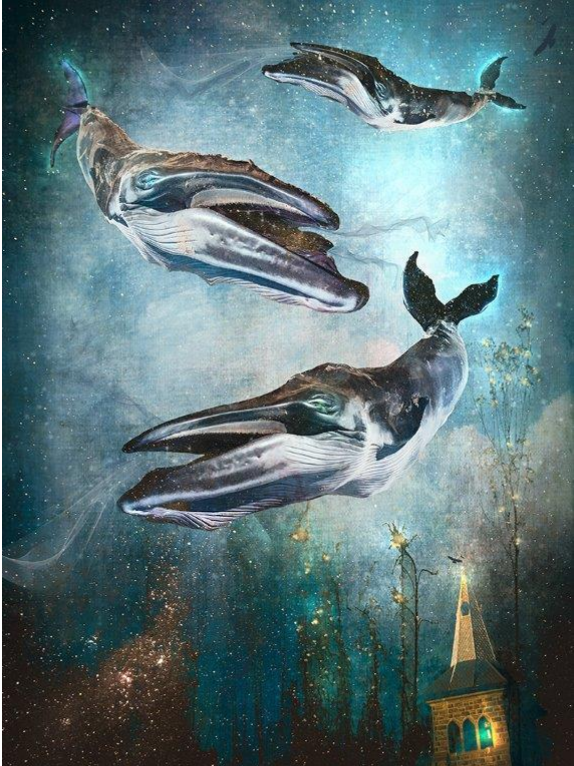
Arrival of the sky whales – Luana Laubscher