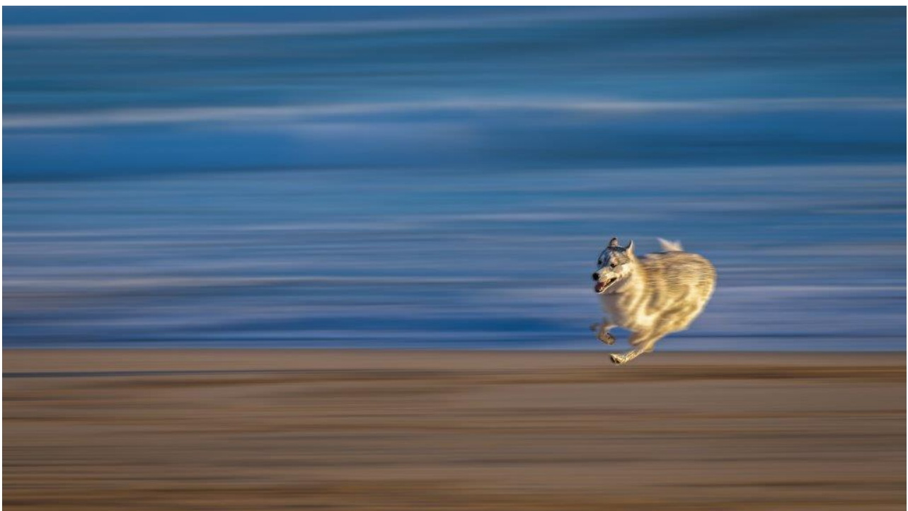
Speed – Cathy Birkett