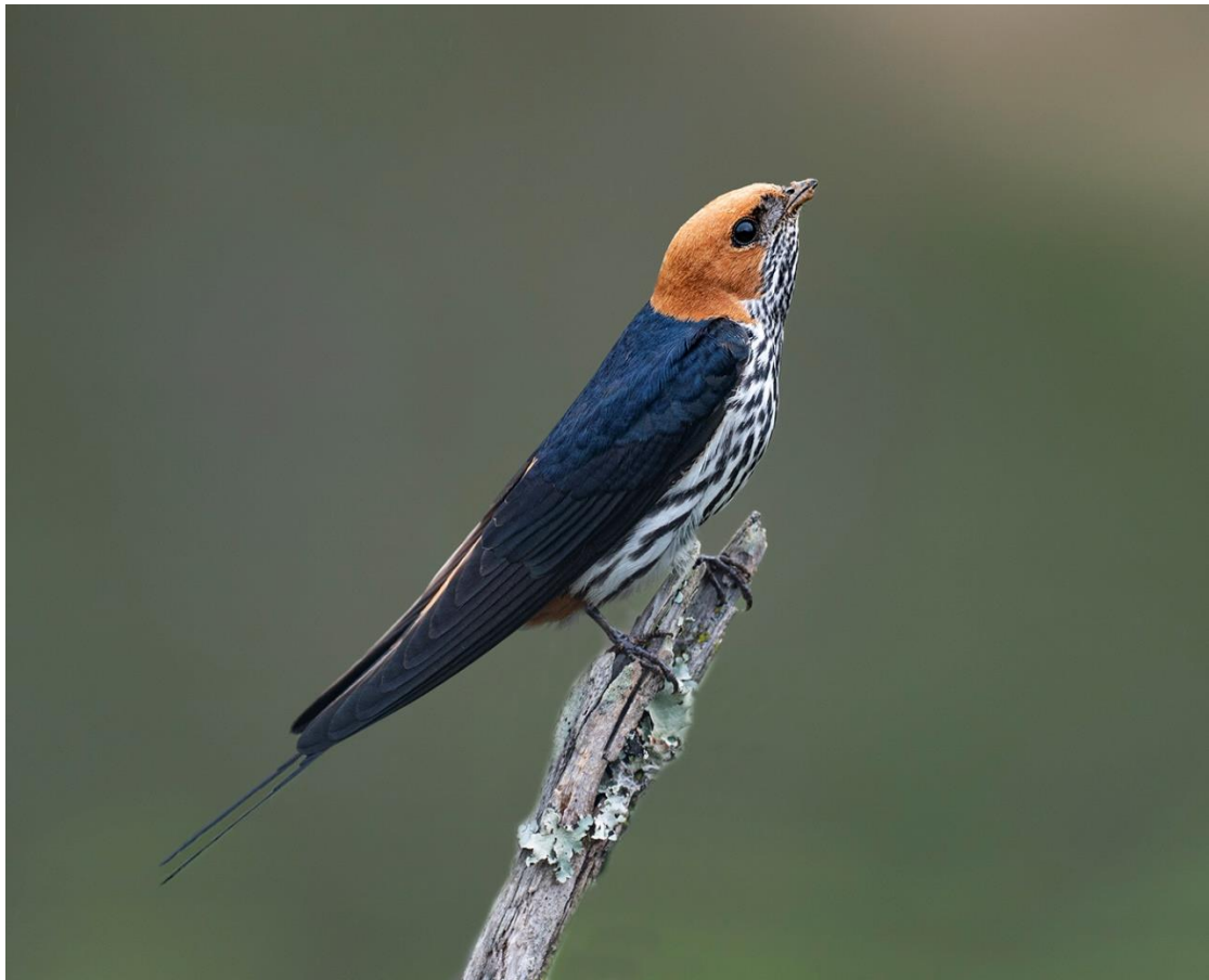
How is my building – Willem de Voogt