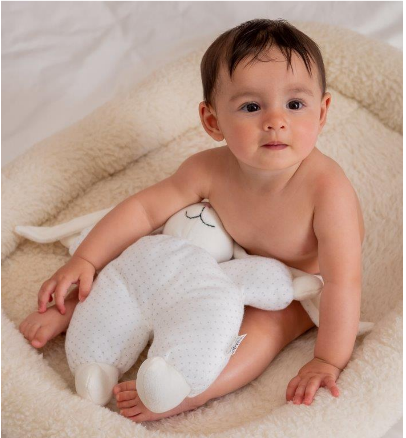
Me and my dudu