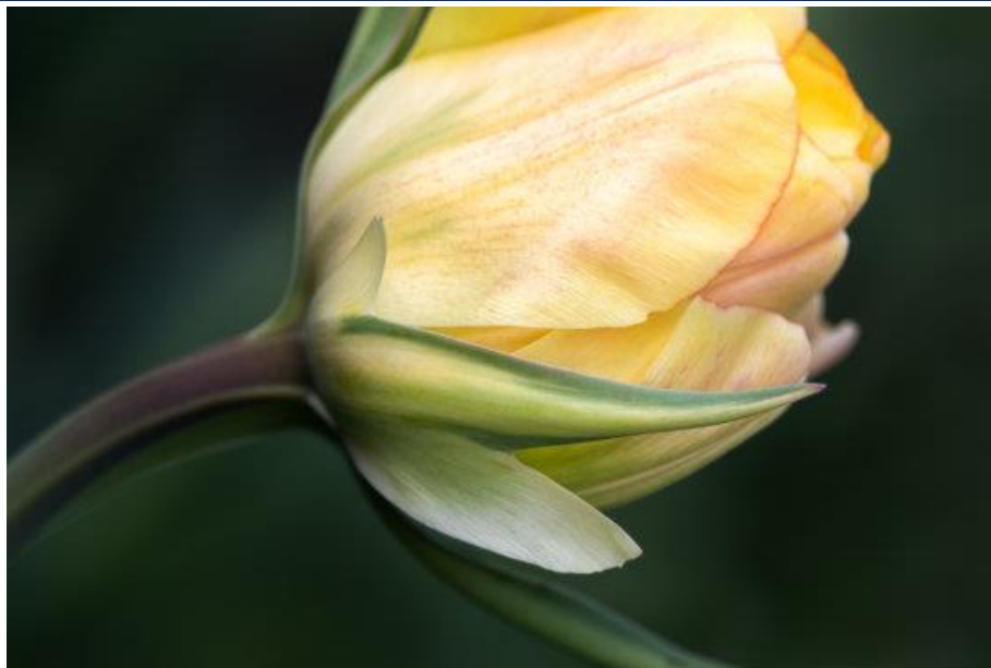
“Akebono Tulip,” 180mm Macro Photography Lens at f/6.3