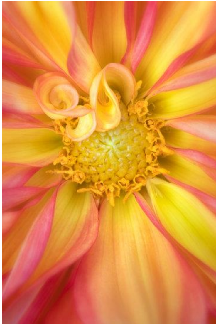
Unusual Flower Photography Subject – “Dahlia with Curls” 100mm Macro Photography Lens at f/11

Once you find an interesting subject, work that subject to its fullest. I often see photographers in garden settings walk up to the first flower they see, take a shot or two and move on. It is not unusual for me to stay with the same flower for over an hour, taking hundreds of images from every angle and composition I can come up with. A good starting point is to ask yourself what drew you to the flower, how does it make you feel? Then, think about how you can compose to bring that element or feelings to others' eyes. Perhaps it is an interesting curl of a dahlia petal, a gentle curve of a leaf or the curve of a stem that makes the flower appear to be dancing.