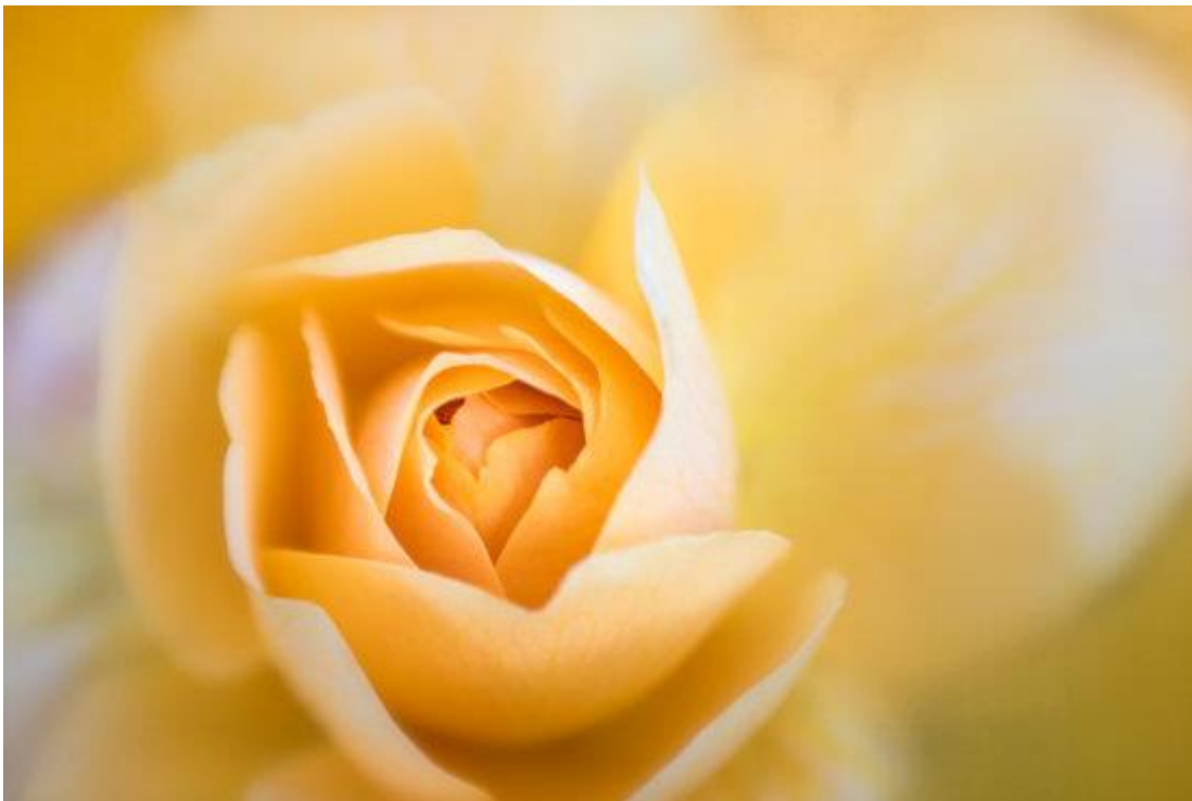
"Rose in Evening Light," Lensbaby Sweet 80 Optic f/4

You have probably heard this mantra over and over, but once I started practicing this, my photography changed dramatically. It sounds so simple, but I find few people actually practice it. Leave your camera in your backpack initially, put your phone away and walk slowly, observing all that is around you. I find that being in nature naturally relaxes me and puts me in more contemplative state of mind. The distractions of the day exit, my mind clears, and my senses are more aware.