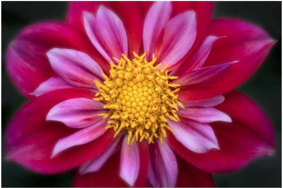
• Centered Flower Photography Composition – “Collarette Dahlia,” 100mm Macro photography Lens at f/13