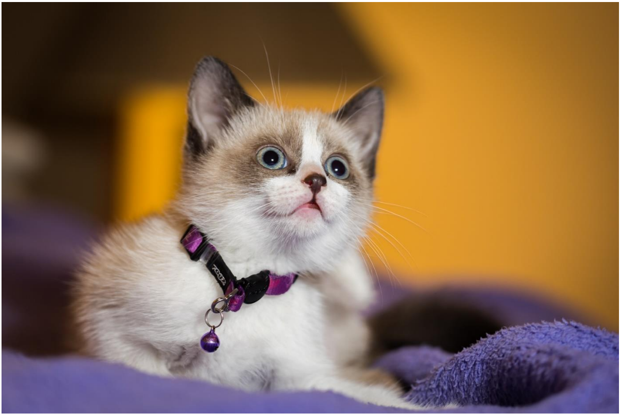
What is up there – Terence Clarke