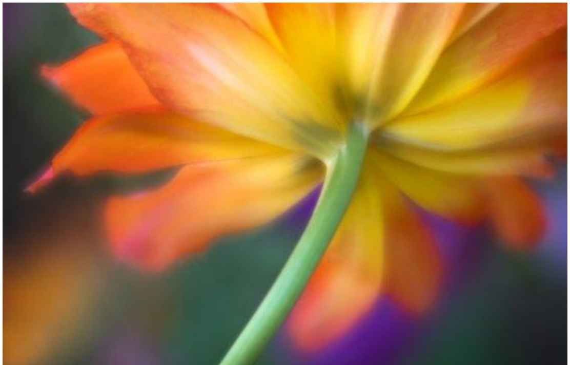
• Flower photography composition using the rule of thirds – “Underneath the Tulip,” Lensbaby Velvet Lens 85mm, f/4

I often start by composing with the rule of thirds in mind. We should all understand this rule and practice it. There is a reason it has been in the art world for hundreds of years – it is an effective way to lead the eye. The rule of thirds is not the only way to compose flowers; we can break this rule when there is a compelling reason to do so. For example, I will often center compose or move the center of the flower to the middle of the frame but slightly offset it. This is an effective composition when emphasizing pattern and symmetry in a flower. Shoot up under the flower, or even behind the flower. Sometimes the backs of flowers are much more interesting than the fronts. By experimenting and working your subject, you will come up with new ideas and perhaps have some aha moments. Many times, I have ended up with a very different composition than I originally imagined by working my subject.