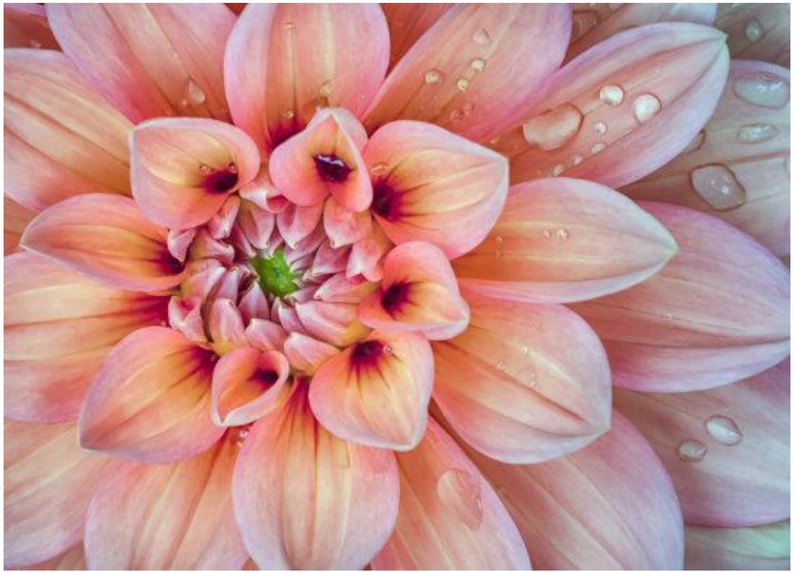
• Wide DOF – “Dahlia with Raindrops,” 100mm Macro Photography Lens at f/13

There is no one right way or right aperture to photograph a flower. Shoot in a way that brings you joy, that conveys the feeling you want to convey and brings your vision to life. Much of my flower photography is done with Lensbaby lenses, shooting in apertures between f/2 – f/5.6 to get the beautiful effects these lenses are known for. This is a way of shooting that excites me and brings creativity to my photography.