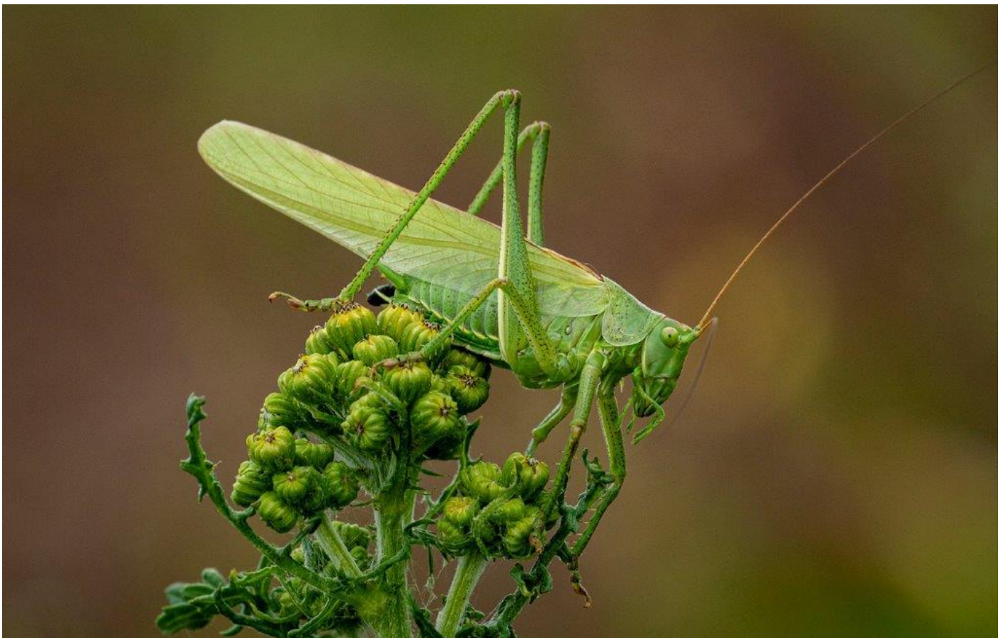
Great Green Bush Cricket