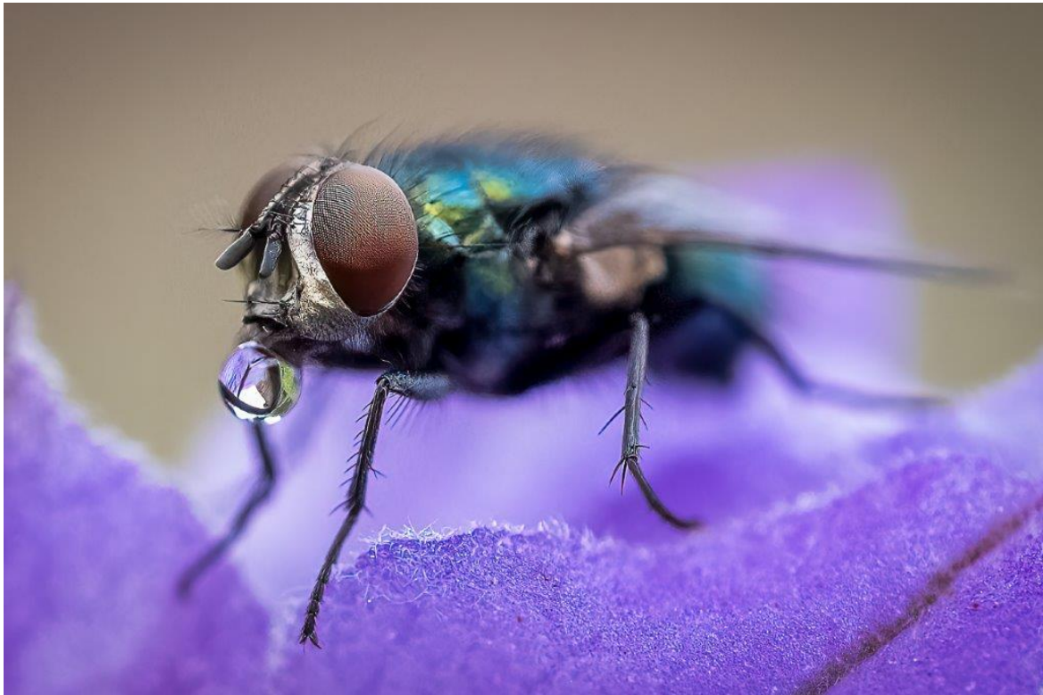
Bubble blower Cathy Birkett