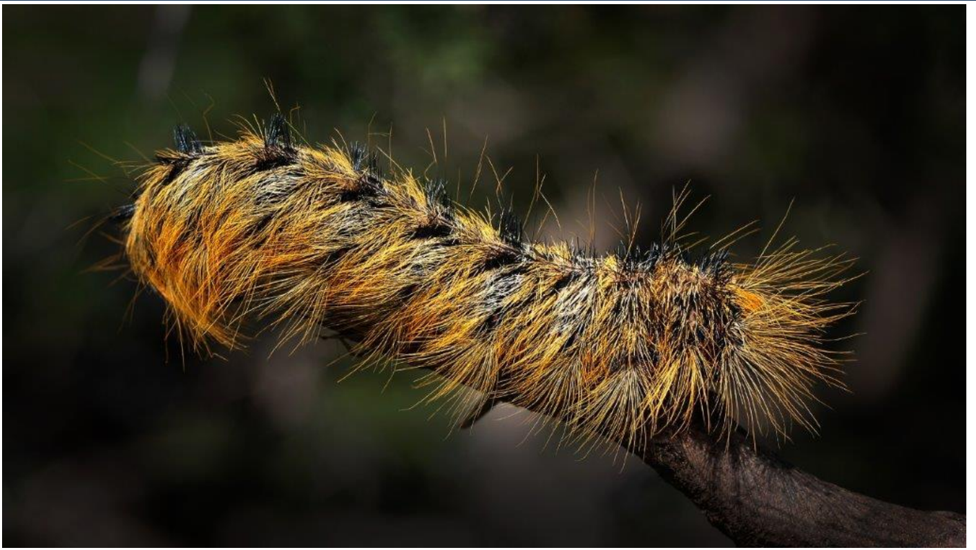
How do you like my hair