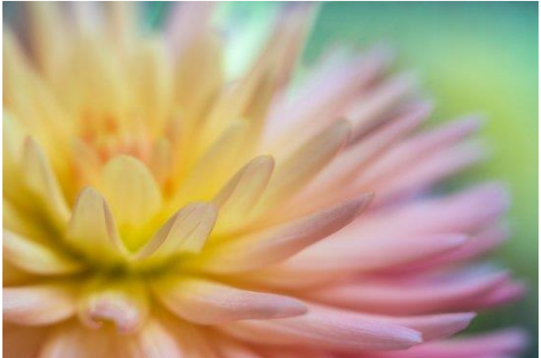
• Selective Focus and Narrow DOF – “Essence of a Dahlia,” Lensbaby Velvet 56mm, f/2.8

As you do this, you might begin to see that you enjoy shooting in the lower apertures (f/2 – f/6.3) using selective focus to bring one element of the flower in focus – the edge of a petal, a ruffle of an orchid. Or you might find you prefer having the entire flower in sharp focus. For this approach, choose a higher aperture (f/11-f/22) and try to align your camera so that it is parallel with the flower.