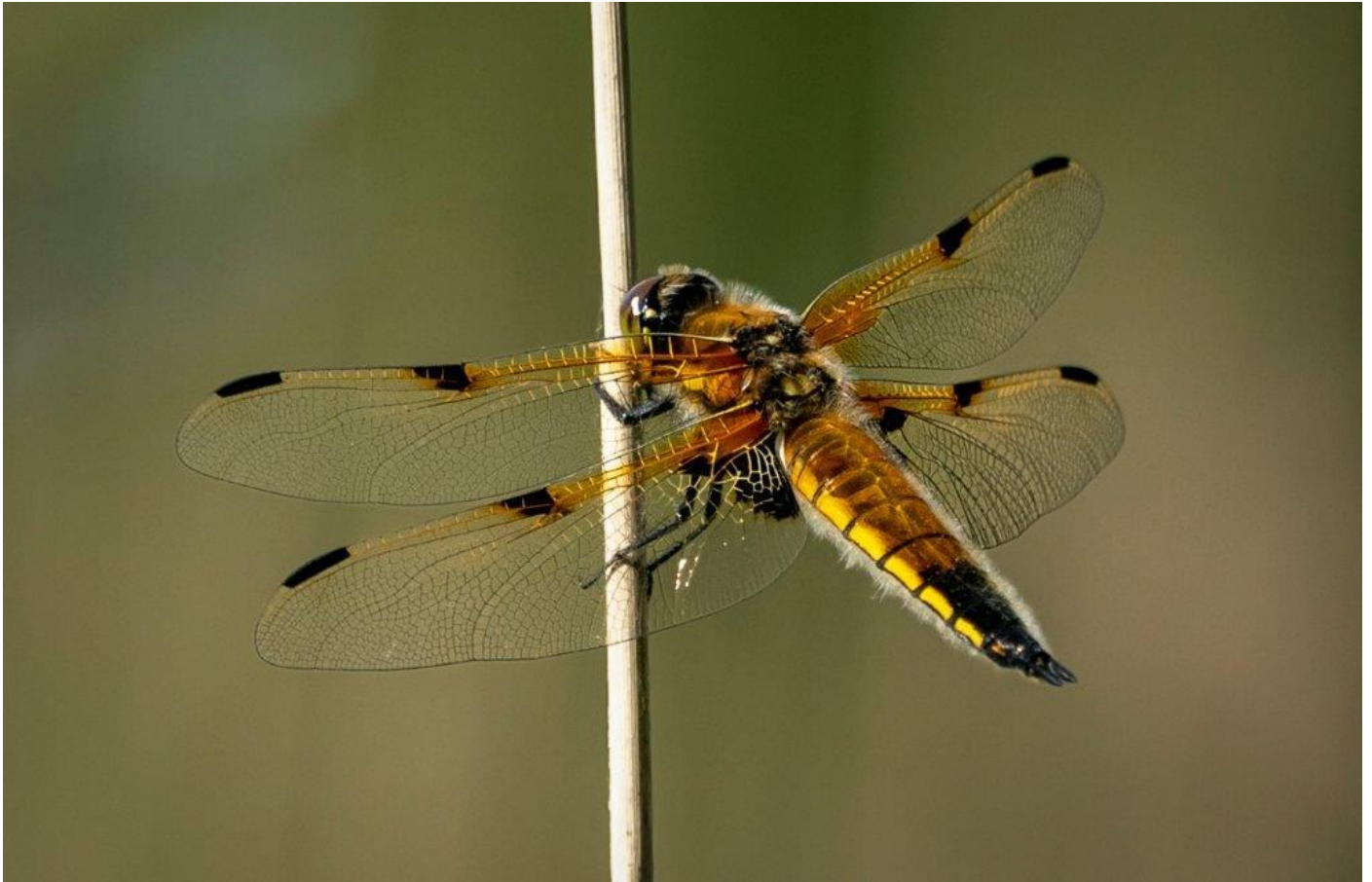
Viervlek Willem de Voogt