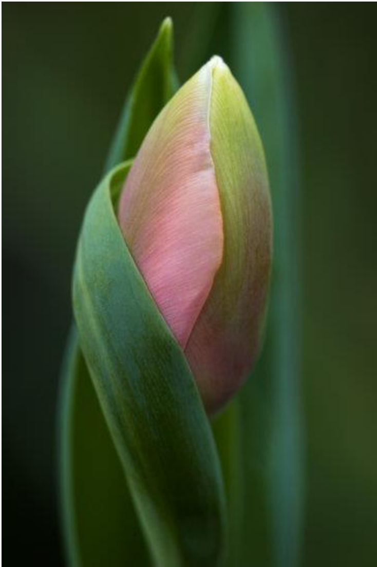
"Embrace," with Canon 180mm Macro Photography Lens at f/4.5

I think most people would agree that being in nature is a kind of therapy. Train your eye to notice details, look for interesting lines, sensuous curves, a unique curl of a petal or leaf. Learn to see your subjects more abstractly, in terms of lines, color, texture, patterns and mood. Slowing down will sharpen your visual skills and help you find more interesting and unique subjects. You will create work that is more impactful, work that evokes feelings and perhaps even stories. For me, the process of finding and capturing images is equally important as the end product. By focusing on the process and enjoying the process, we will more likely convey those feelings to others.