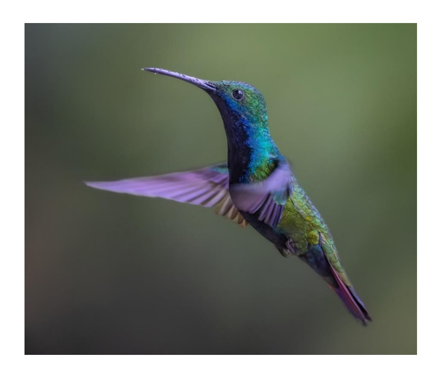
PSSA WEBSITE PICTURE OF THE MONTH NOVEMBER 2024 Cathy came 6<sup>th</sup> shared with2 photographers out of 35 entries FLY ON YELLOW