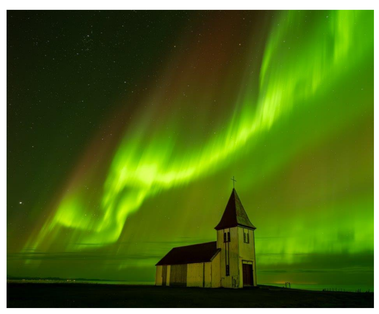
Hellnar church - Anne Hrabar