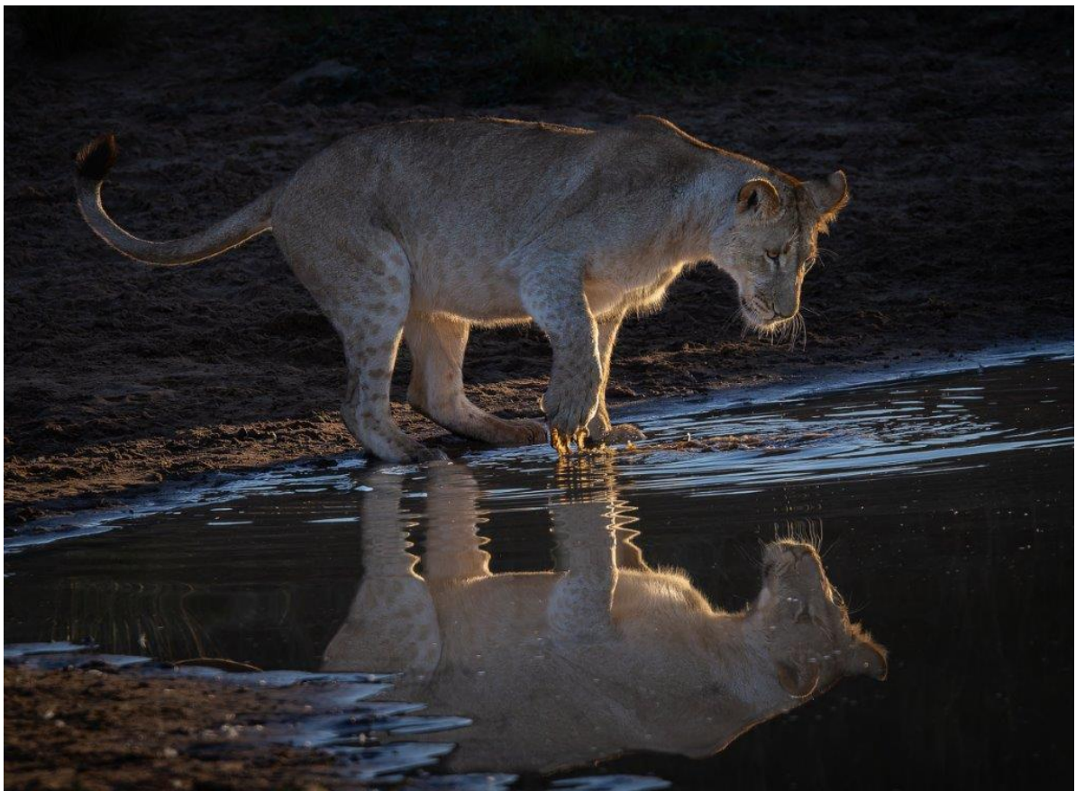
Lion reflection - Pieter Mare