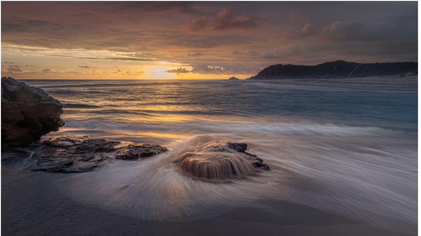
Cloudy sunset - Cathy Birkett