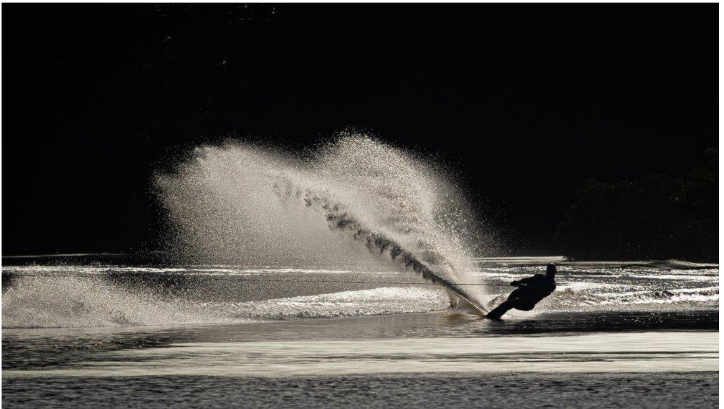
Moonlight warrior - Etienne Muller (POM to PSSA)