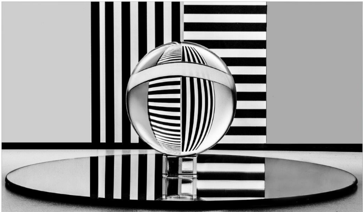
Boldly black and white - Carol Phillips

A five-way tie!! In alphabetical order!!